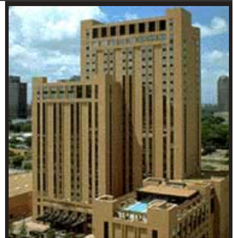
J.W. Marriott Hotel By The Galleria 5150 Westheimer Road Houston, TX 77056

http://www.tjcsга.org or http://college.hccs.edu/admin/ students/host/index.htm